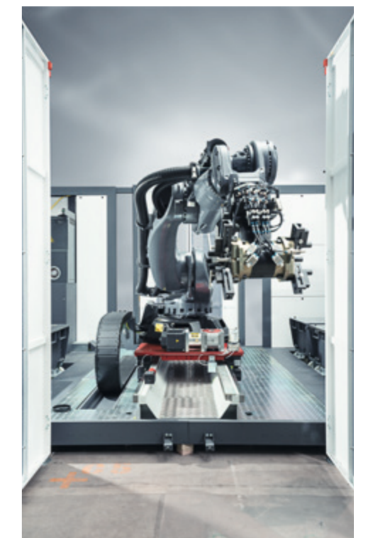
Robot and machine tools are easily accessible, for instance when exchanging clamping devices and tools